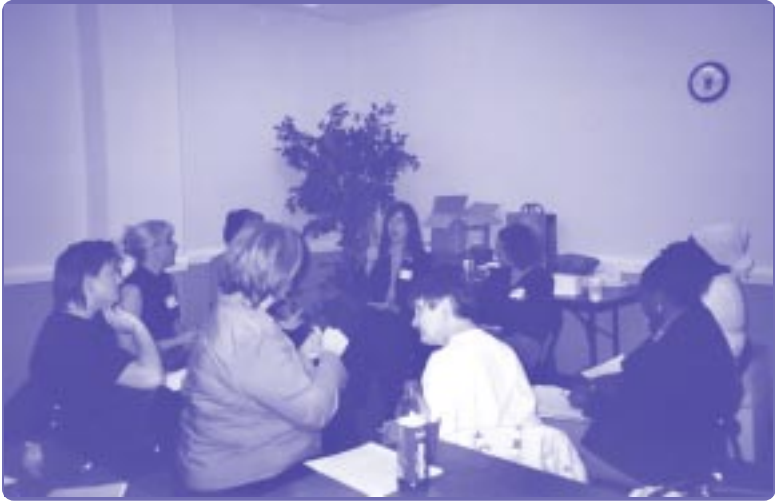
A meeting of the Deaf Outreach Committee

With half a million dollars in new federal funding, VADV, Virginians Aligned Against Sexual Assault (VAASA), and the Global Organization of Feminists with Disabilities (GoFWD) began implementing a comprehensive plan to make domestic violence, stalking, and sexual assault information and services in Virginia more accessible and culturally sensitive to women with disabilities.