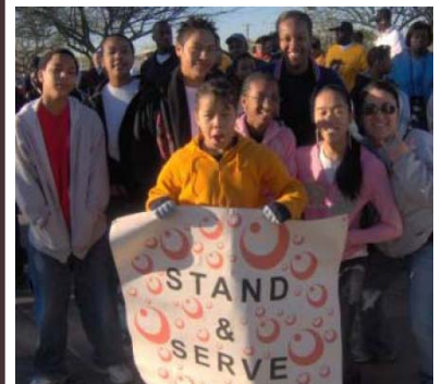
Figure 1: (Adapted from Lang, et al., 2007)